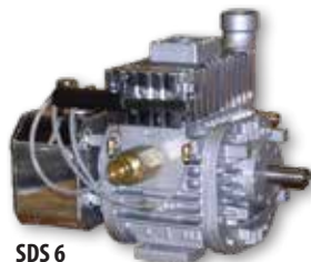
SDS 6 PUMP