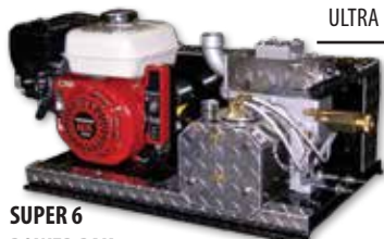
SUPER 6 POWER PAK