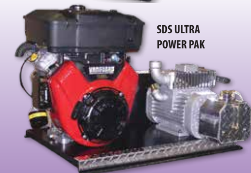
SDS ULTRA POWER PAK