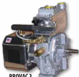
PROVAC 3 PUMP