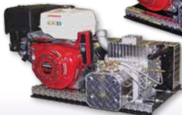
12 SDS POWER PAK