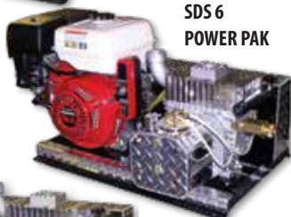
SDS 6 POWER PAK